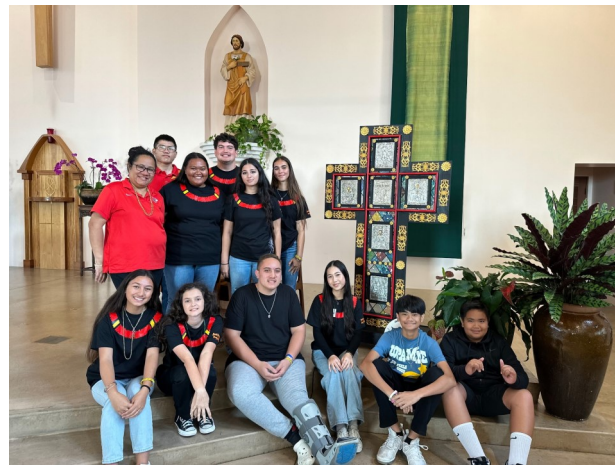
Big Island Youth Day was held on March 1, 2025 at St. Michael's in Kona. St. Joseph was represented by members of EPIC Ministry and also youth from St. Joseph School and Church.