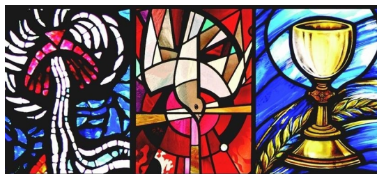
OFFER, STRENGTHEN, SUSTAIN

raments became separated from one another. In the renewal stemming from the Second Vatican Council, the Church was asked to more clearly set forth the intimate connection of Confirmation with the whole of Christian initiation. This original order also helps us recognize that sharing in the Eucharist completes our initiation into the Church and that it is Eucharist which is the “source and summit of our faith.”