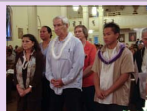
Catechumens from Sacred Heart participate in the Rite of Election.