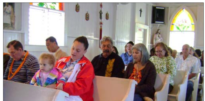
Parishioners sing the offertory song.