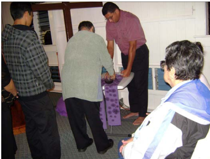
Each parishioner comes forward to mark the stole with ashes. The stole was then draped on the cross for the Lenten season.