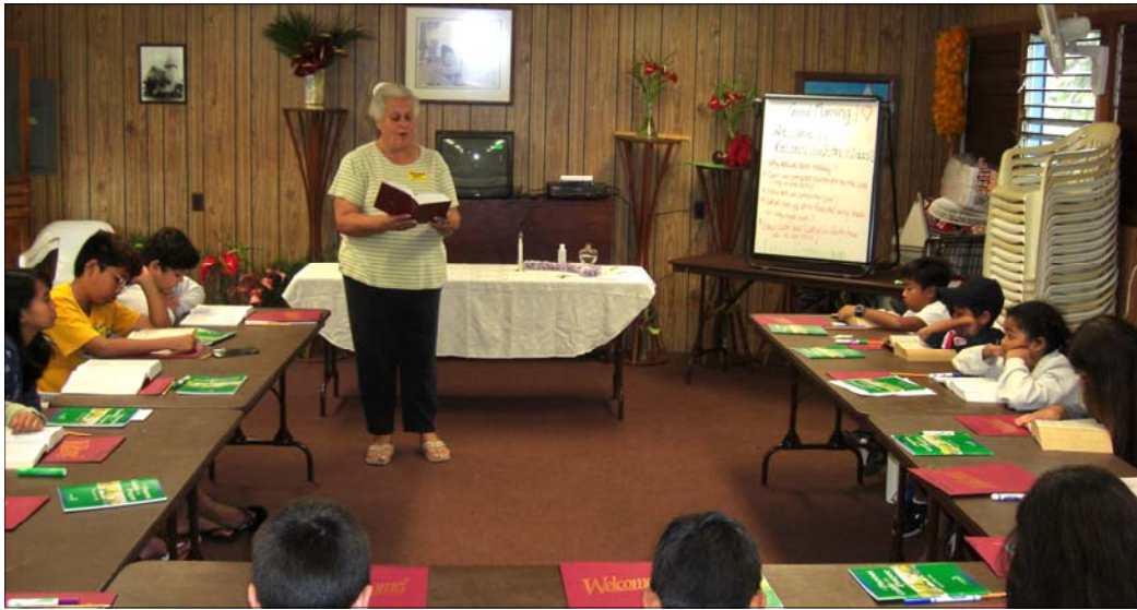
Seventeen students attended a sacramental preparation class at Malia on Saturday, February 28, 2009.