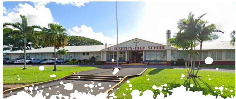
St. Joseph School

Providing Insurance and Financial Services