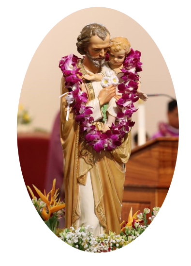
Please remember St. Joseph Parish in your will!

Served by the Blessed Sacrament Congregation