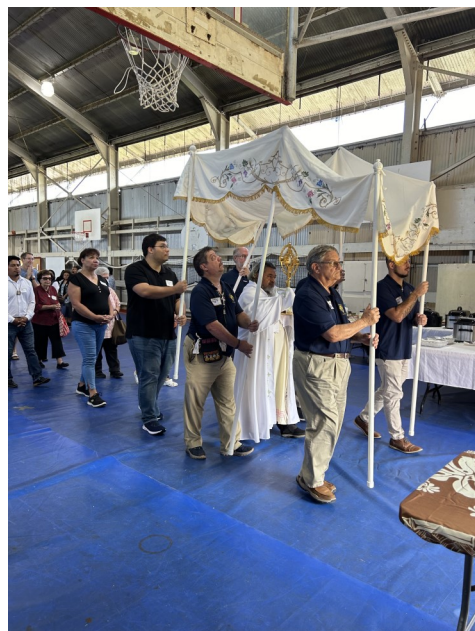
EUCCHARISTIC PROCESSION FOR CHRIST THE KING