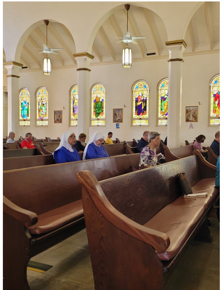
October 12th Rosary Congress