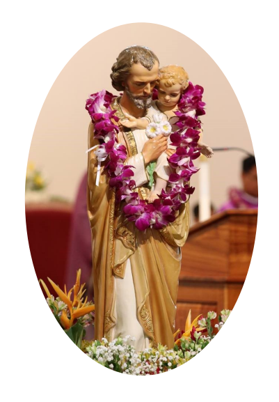
Please remember St. Joseph Parish in your will!

Served by the Blessed Sacrament Congregation