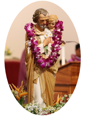
Please remember St. Joseph Parish in your will!

Served by the Blessed Sacrament Congregation