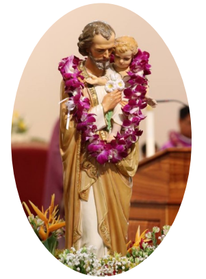
Please remember St. Joseph Parish in your will!

Served by the Blessed Sacrament Congregation