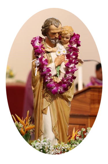
Please remember St. Joseph Parish in your will!

Served by the Blessed Sacrament Congregation